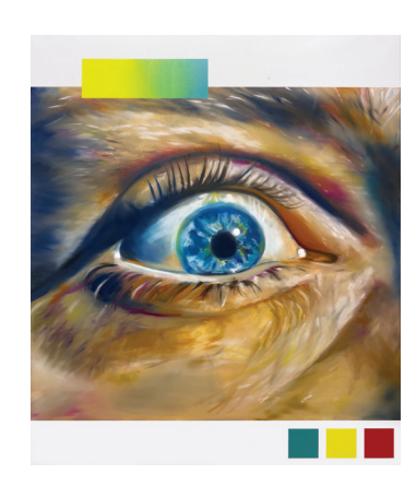
TWEye., 2022 Oil on canvas 120 x 140 cm Courtesy of the artiste © Filip Markiewicz