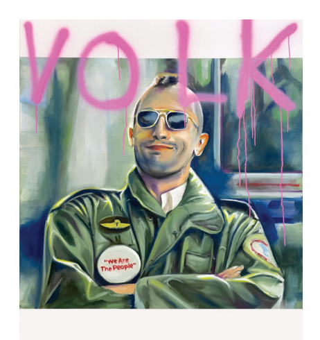
VOLK, 2022 Huile sur toile 140 x 120 cm Courtesy de l'artiste © Filip Markiewicz

VOLK (2022) is a reinterpretation of a photogram taken from the film "Taxi Driver" (1976) by Martin Scorsese. The Travis Bickle character, the American anti-hero played by Robert de Niro, wearing the subverted badge with the text "Wir sind das Volk" is another example of Filip Markiewicz's subversion strategies. This borrowing of a sentence dating from the dissolution of the German Democratic Republic (GDR) was again used during recent antivax demonstrations. These multiple and essentially different borrowings of the term VOLK, but also the disturbance of the pink tag on the "photopeintrie" make this painting a collection of references that calls for complex and codified modes of interpretation.