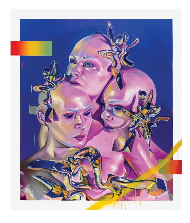
Instant Comedy, 2022 Oil on canvas 210 x 180 cm Courtesy of the artist © Filip Markiewicz