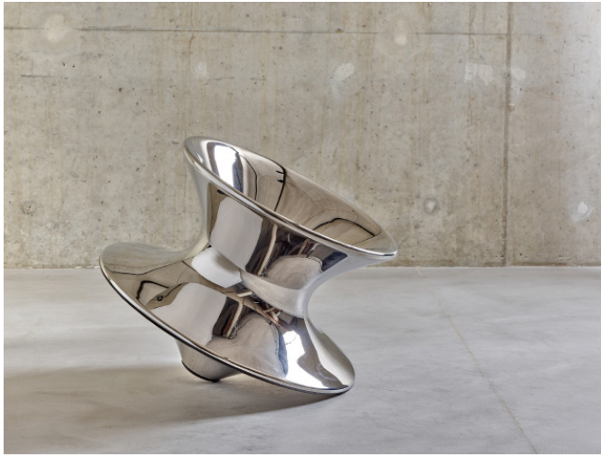
Thomas Heatherwick, Spun Chair, 2016, Stainless steel Ø 88 x 65 cm, Courtesy of Heatherwick Studio, London © Remi Villaggi