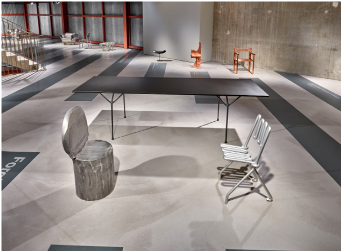
metalworks - designing & making Konschthal Esch, 2022