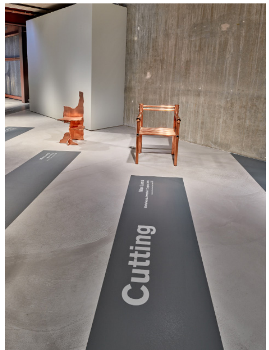
metalworks - designing & making Konschthal Esch, 2022