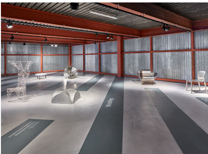
metalworks - designing & making Konschthal Esch, 2022