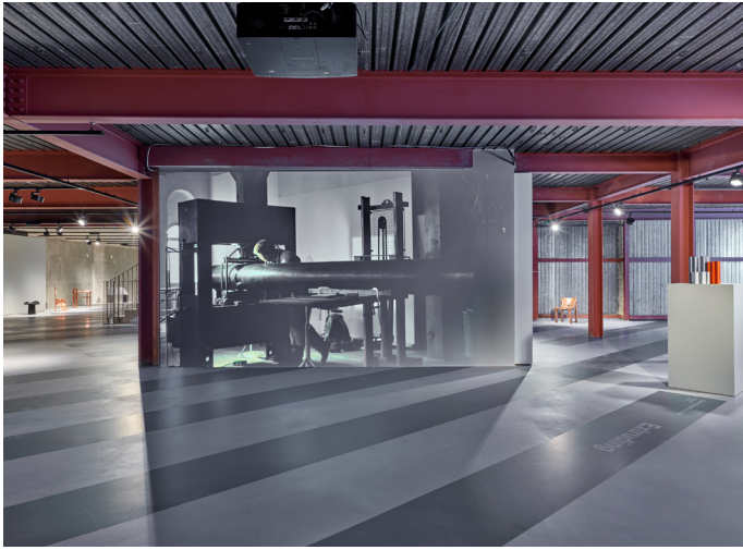
metalworks - designing & making Konschthal Esch, 2022