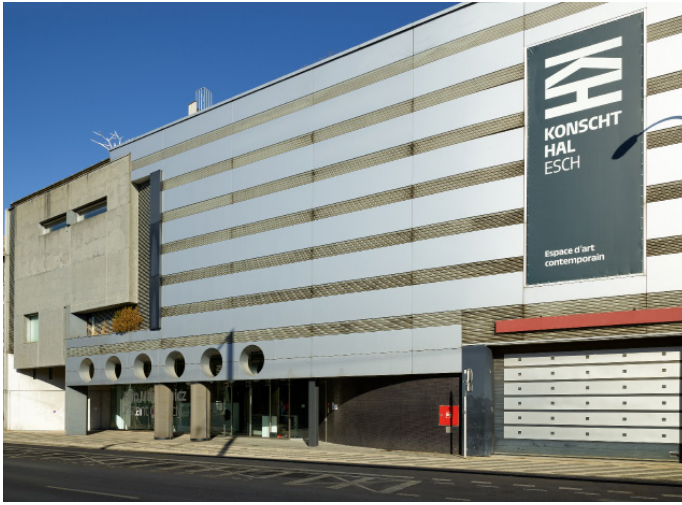
Konschthal Esch