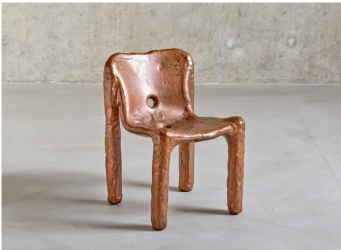
Max Lamb, Nanocrystalline Copper Chair, 2010, Copper 65 x 43 x 45 cm, Courtesy of the artist and Gallery FUMI, London © Remi Villaggi