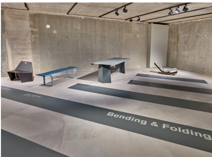
metalworks - designing & making Konschthal Esch, 2022