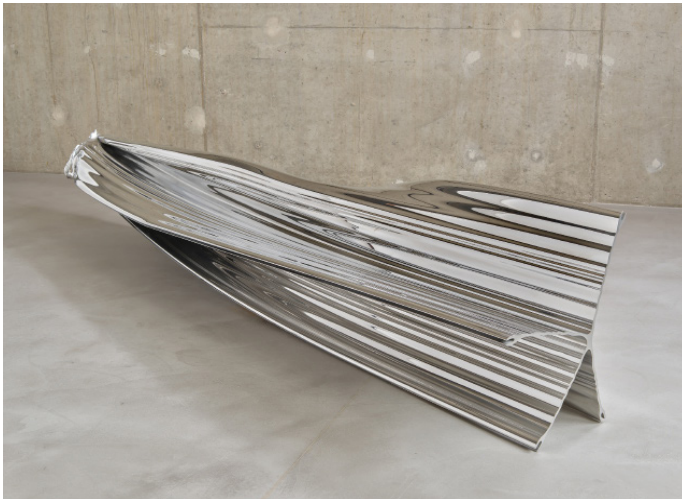
Thomas Heatherwick, Extrusion (Billet 6, Extrusion 3), 2016, Polished aluminium 75 x 360 x 55 cm, Courtesy of Heatherwick Studio, London © Remi Villaggi