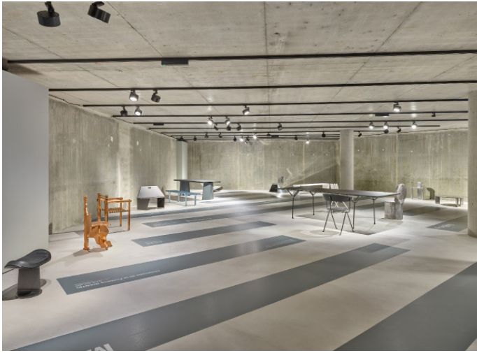
metalworks - designing & making Konschthal Esch, 2022