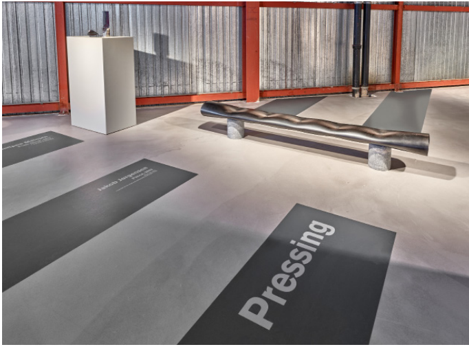
metalworks - designing & making Konschthal Esch, 2022