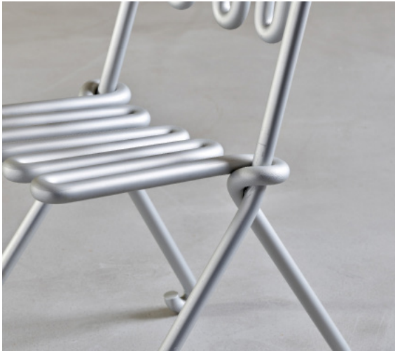
Max Lamb, Ali Bar Chair, 2016, Aluminium 72 x 41 x 36 cm, Courtesy of the artist and Salon 94 Design, New-York © Remi Villaggi