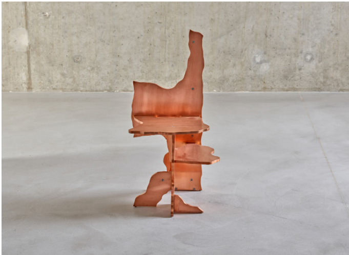
Max Lamb, Jigsaw, 2017, Copper 85 x 40 x 40 cm, Courtesy of the artist and Gallery FUMI, London © Remi Villaggi