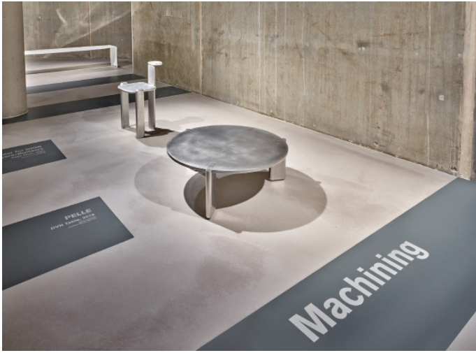
metalworks - designing & making Konschthal Esch, 2022