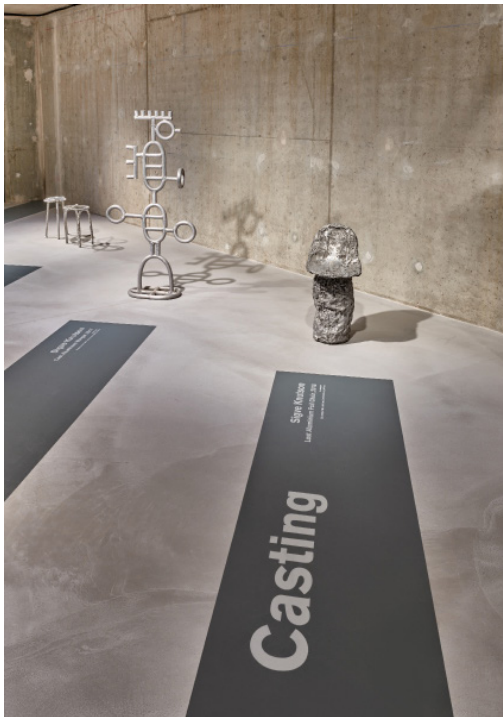
metalworks - designing & making Konschthal Esch, 2022