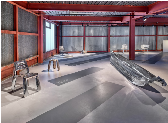
metalworks - designing & making Konschthal Esch, 2022