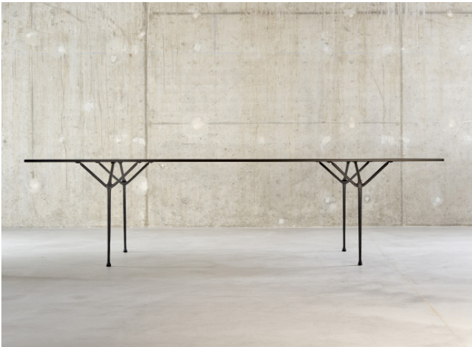
Ronan and Erwan Bouroullec, Officina collection table, 2015, Wrought-iron structure, steel, polypropylene, Edition Magis 74 x 280 x 95 cm, Acquisition Kunschthal Esch