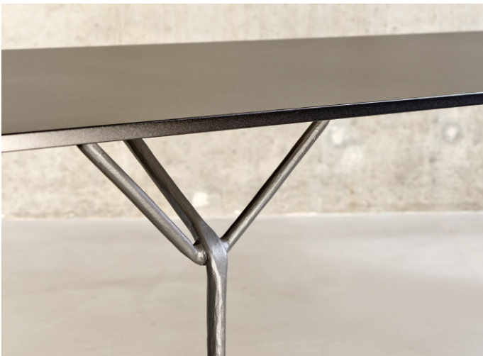
Ronan and Erwan Bouroullec, Officina collection table, 2015, Wrought-iron structure, steel, polypropylene, Edition Magis 74 x 280 x 95 cm, Acquisition Kunschthal Esch