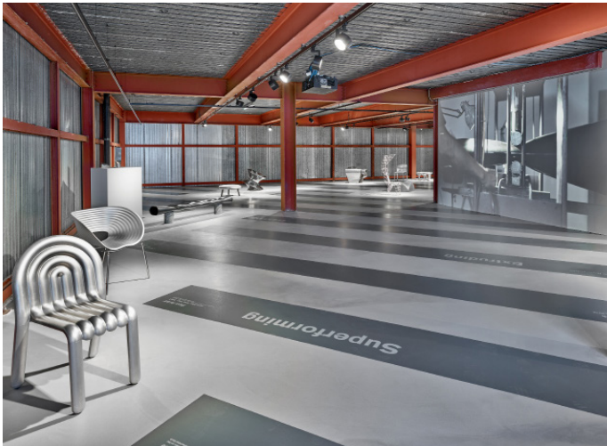
metalworks - designing & making Konschthal Esch, 2022