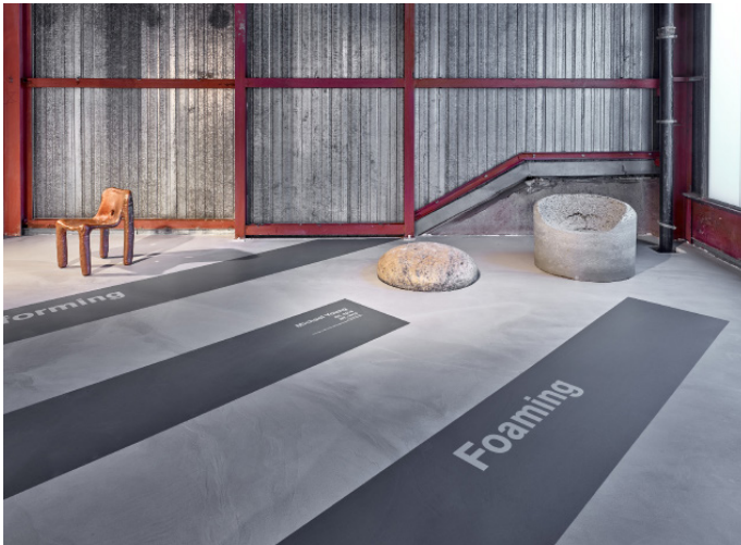
metalworks - designing & making Konschthal Esch, 2022