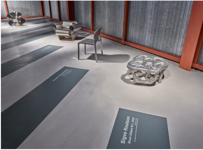
metalworks - designing & making Konschthal Esch, 2022