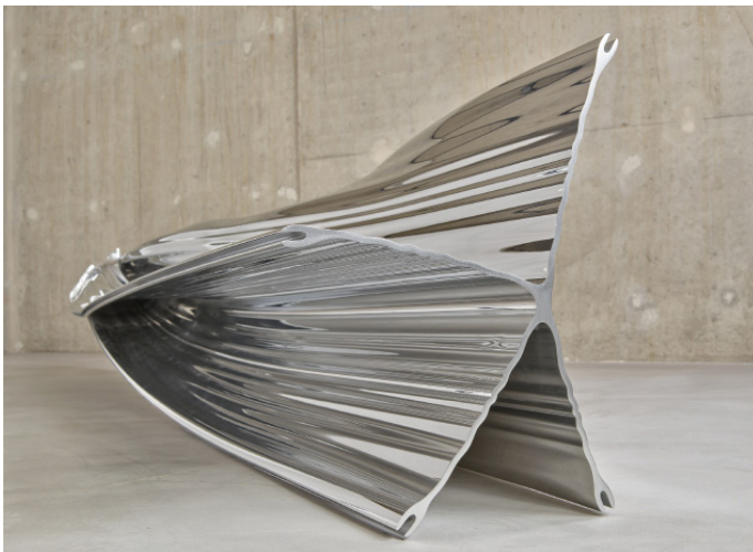
Thomas Heatherwick, Extrusion (Billet 6, Extrusion 3), 2016, Polished aluminium 75 x 360 x 55 cm, Courtesy of Heatherwick Studio, London © Remi Villaggi